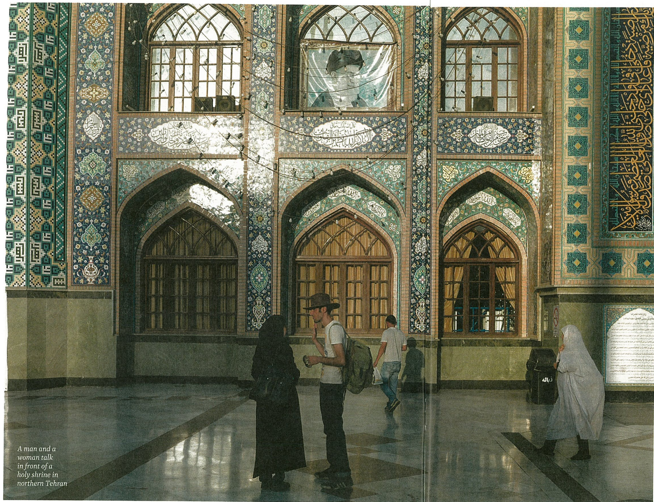
A man and a woman talk in front of a holy shrine in northern Tehran