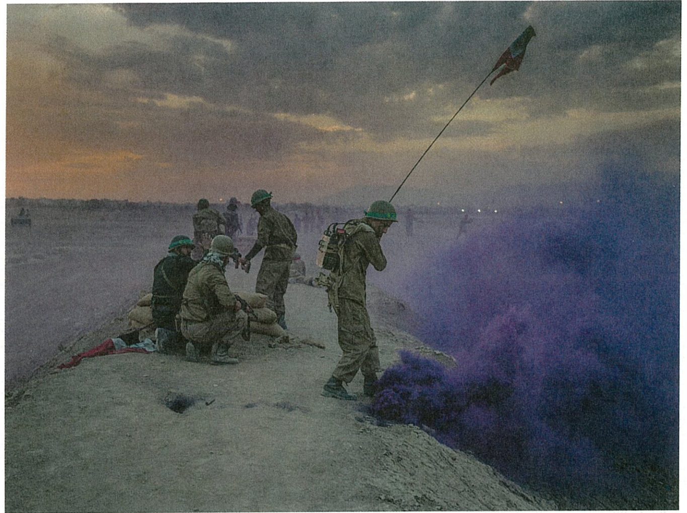
Members of an Iranian paramilitary force re-enact a battle from the Iran-Iraq War; the U.S. backed Iraq

But it's Khamenei who really requires convincing